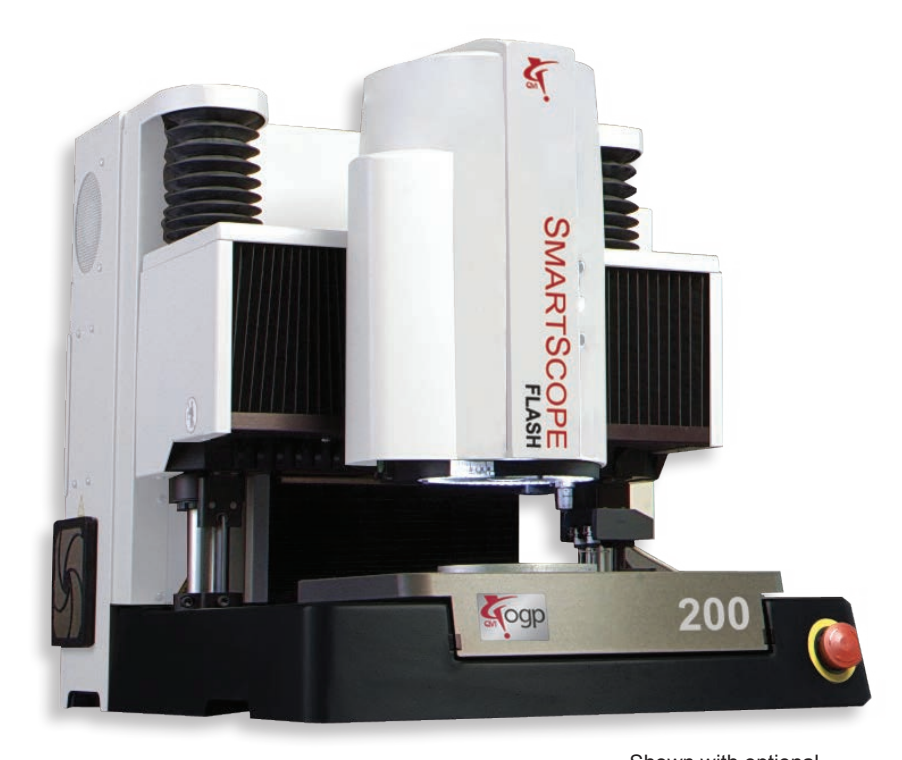
Shown with optional touch probe & QVI TTL laser