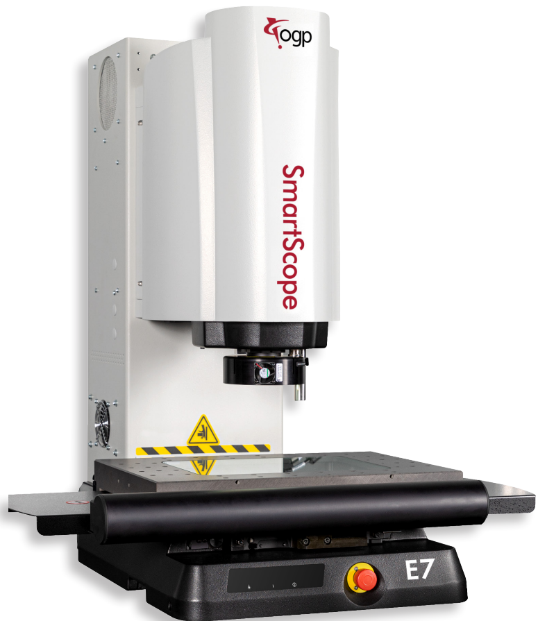
Shown with optional Touch Probe.